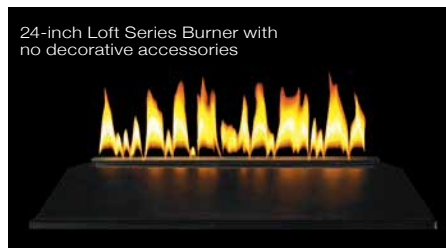
24-inch Loft Series Burner with no decorative accessories

Available for all Loft Series Burners and Loft Series Multi-Sided Burners. For a complete list of decorative media, please see page 17.