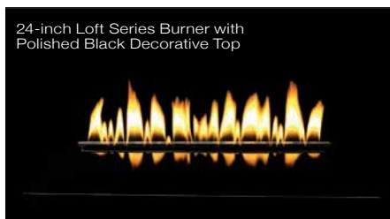
24-inch Loft Series Burner with Polished Black Decorative Top