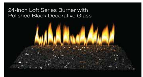
24-inch Loft Series Burner with Polished Black Decorative Glass