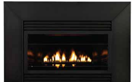
Loft Series Vent-Free Fireplace with Glass Panel Frame and 6 x 6-inch Metal Insert Surround

For a complete list of decorative media, please see page 17.