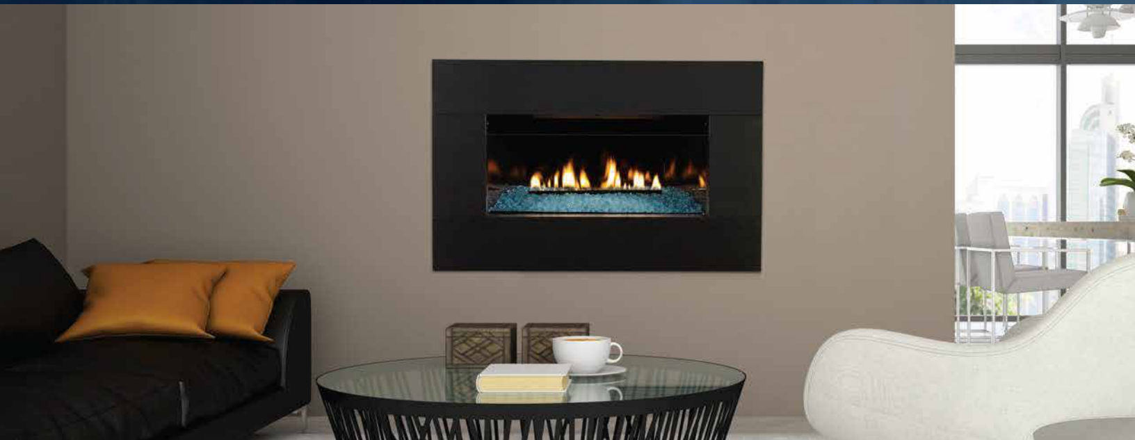
Loft Series Vent-Free Fireplace and Metal Frame with Glass Panel