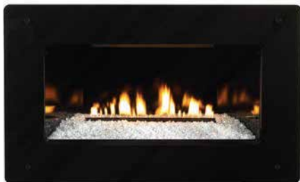
Loft Series Vent-Free Fireplace with Clear Frost Decorative Glass and Decorative Glass Front

Installed as an insert, your Loft system will require the three-sided decorative surround. Like the four-sided frame, this surround measures 1 3/4-inch deep and makes a clean transition from an existing fireplace.