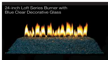
24-inch Loft Series Burner with Blue Clear Decorative Glass