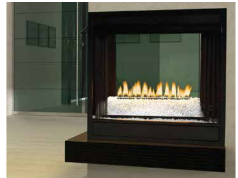
24-inch Loft Series Multi-Sided burner with Clear Frost Decorative Glass shown in a Breckenridge 36-inch See-Through Firebox

All Loft Series burners are available in remote-ready Millivolt system with a manual Piezo Ignition or Battery Operated Remote Control Intermittent Pilot that allows you to have a standing pilot or operate with an intermittent pilot to save gas.