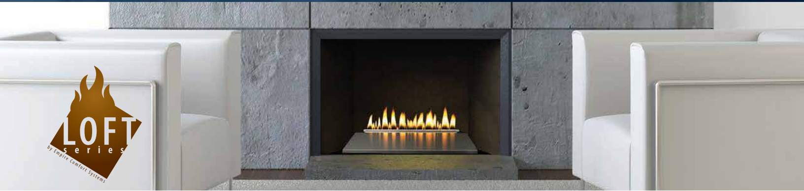
24-inch Loft Series burner with Brushed Stainless Steel Decorative Top shown in an existing masonry firebox