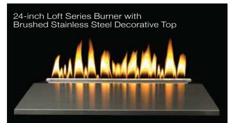
24-inch Loft Series Burner with Brushed Stainless Steel Decorative Top