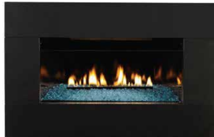
Loft Series Vent-Free Fireplace with Blue Clear Decorative Glass and Metal Frame with Glass Panel