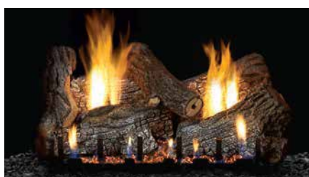
Sassafras Refractory Log Set