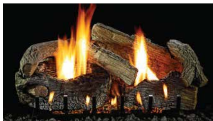
Stacked Aged Oak Refractory Log Set