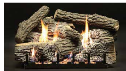
Super Stacked Wildwood Refractory Log Set

See log sets burning at whitemountainhearth.com .