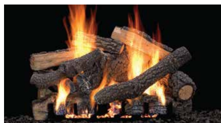
Ponderosa Refractory Log Set