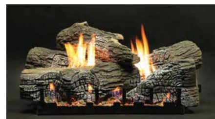
Stacked Wildwood Refractory Log Set