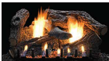
Super Sassafras Refractory Log Set