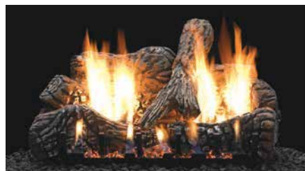
Charred Oak Ceramic Fiber Log Set (16-inch only)