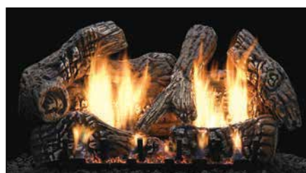
Super Charred Oak Ceramic Fiber Log Set