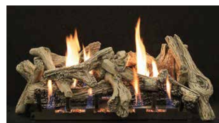
Driftwood Burncrete® Log Set